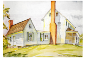
Watercolor of Sunnyside.

In the Fall of 2019, UMD's Historic Preservation Graduate Studio partnered with MNCPPC and PALS to create a Heritage Trail Plan for the areas of Aquasco-Woodville, Eagle Harbor, and Cedar Haven. The goal was to provide visitors with a navigable narrative of life and culture in the area through the production of a trail guide, map, and markers which would be accompanied with an audio tour for cyclists and motorists. After months of research and deliberation the students are happy to present their trail, "Changing Landscapes: Farmsteads and Resort Towns."