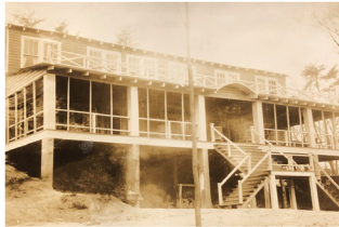
Cedar Haven Hotel

Cedar Haven Hotel Cedar Haven, Maryland ADJACENT TO EAGLE HARBOR, MD. Thirty Miles from Washington, D. C. Advertisement for Cedar Haven Hotel. Source: Afro-American, 1930.