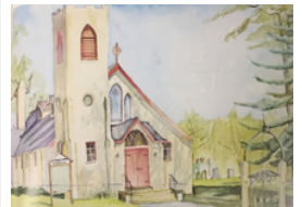
Watercolor of St. Mary's. Source: Betty Taussig