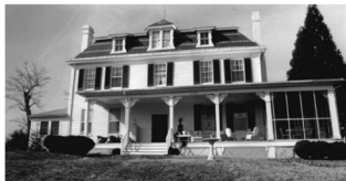
William R. Barker House