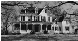
Villa DeSales