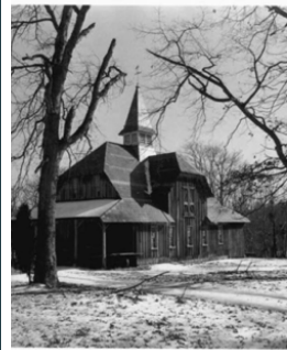
The Stable at Villa DeSales.

Woven together, these sites tell different strands of the community's history. The themes which emerge from these sites span across time and place to capture some of the complexities of this rural community. Each theme is represented by a color and symbol on the trail map. Each site marker will have the corresponding color and symbol.