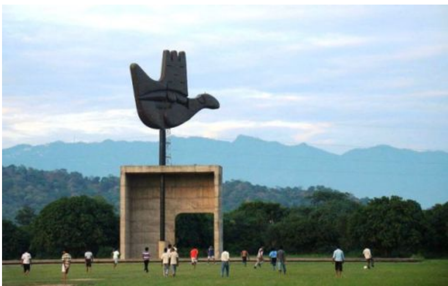
The Open Hand Monument, Chandigarh, India