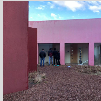
Santa Fe, New Mexico

On March 12, the University of Maryland HUD Innovation in Affordable Housing Student Design and Planning Competition team journeyed to Santa Fe, New Mexico for a site visit in preparation for the final presentations scheduled for April 16 from 1:00 to 4:30 pm. The final presentation will be held virtually via a Zoom webinar.