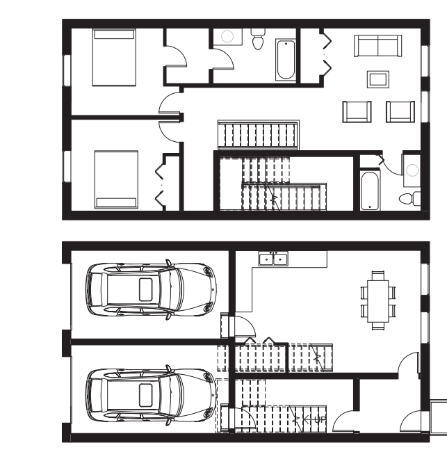
2-bedroom two over two