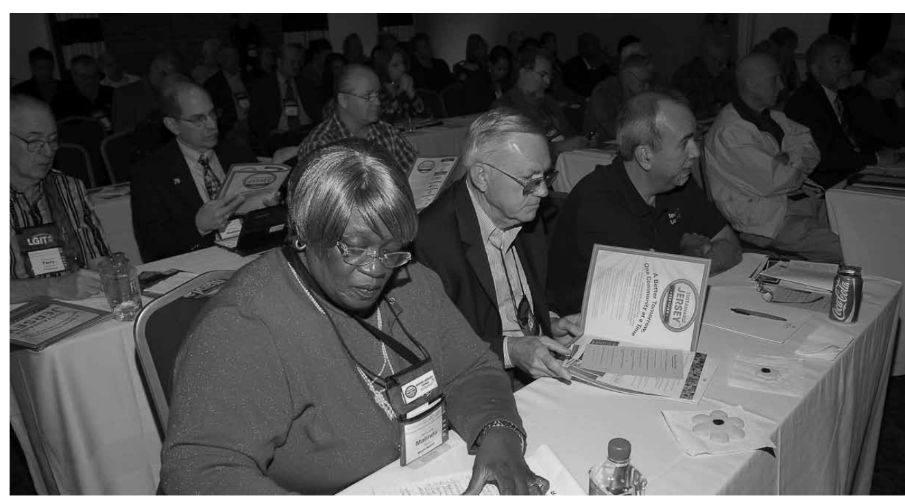
Makeover Montgomery Conference organized with Montgomery County to address urban issues facing the region.