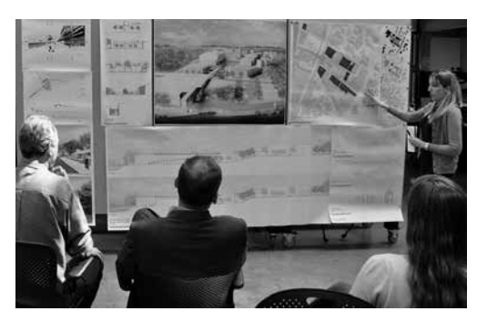
ABOVE: The Architecture Program's Salisbury Studio where students and faculty piloted the PALS initiative.