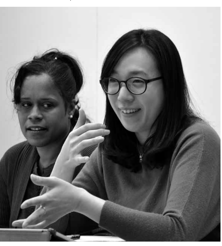
Graduate students in the URSP Program discuss development issues for Baltimore City.

A semester-long fall planning studio examined the decades-long identity crisis of Baltimore's Westside district, the historic once-retail hub of Charm City and neighborhood home to the Hippodrome and the iconic Lexington Market. Closely examining the scale and paradigm of the current development plan, the student project looked to define the district's role in an evolved Baltimore economy while proposing a revitalization that is community driven, preservation oriented and that capitalizes on the district's creative energy.