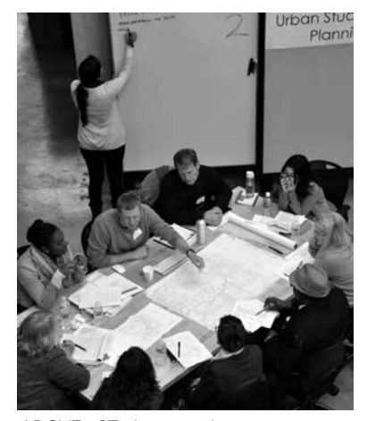
ABOVE: STudents and community leaders work on a plan.