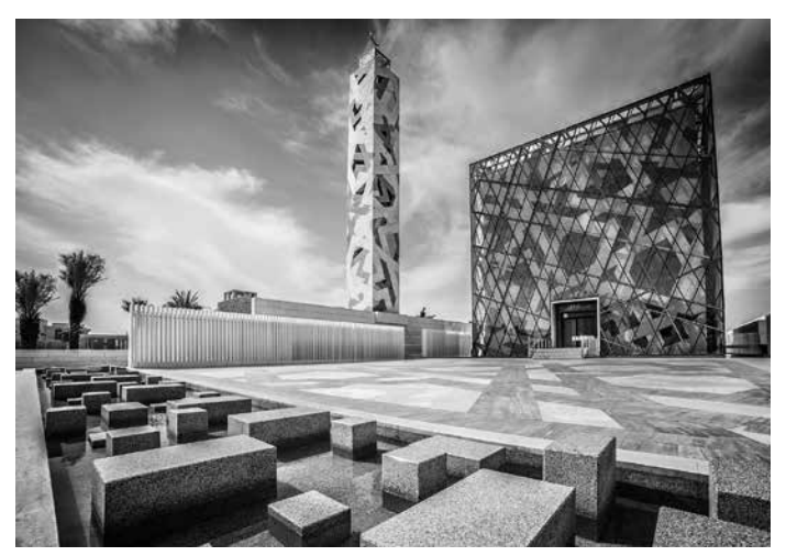
project also includes 10 public buildings that are tracking LEED Platinum.

Roger Schwabacher ( M.ARCH '99 ) recently finished construction of a 200+ building campus in Saudi Arabia called KAPSARC. It is the first and largest LEED for Homes project outside of North America, with all 191 villas certified LEED Gold. The